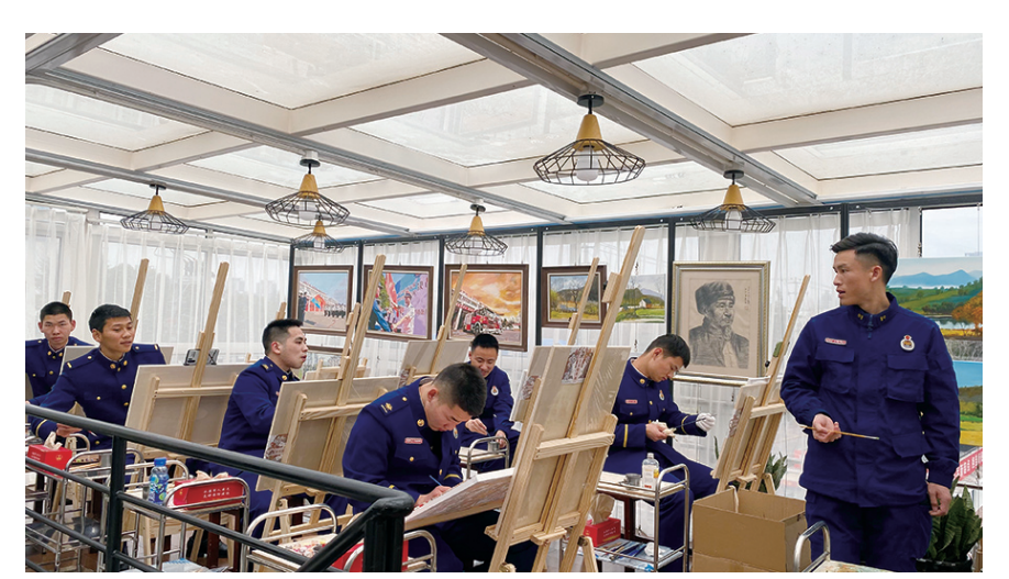
He teaches oil painting to his colleagues at a newly-launched workshop with finished artworks hanging on the window.